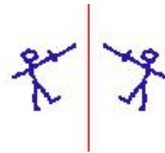
Axis of symmetry